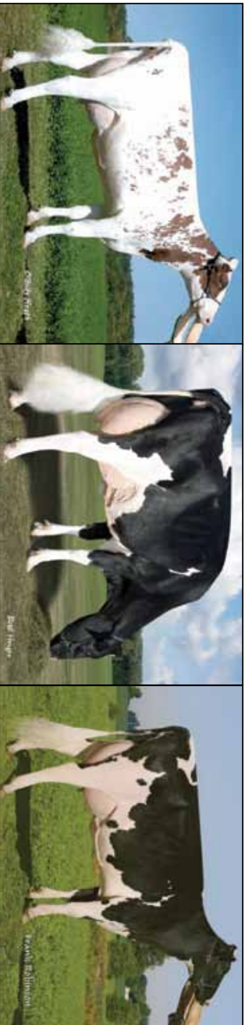
Greenlea SS Mime-Red-ET VG-88 EX-MS Dam of Monty-Red